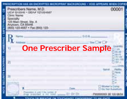
One Prescriber Sample